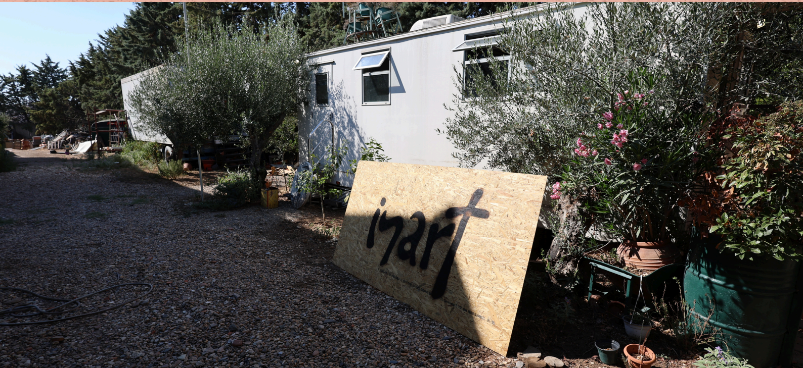
Collective lunch at ΦΙΞ in art